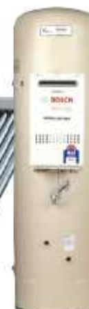
315 Litre Tank