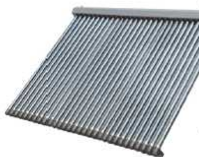
30 Tube Collector