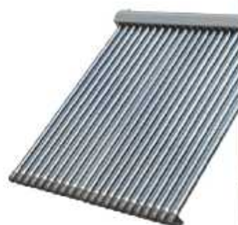
22 Tube Collector