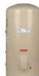
160 Litre Tank