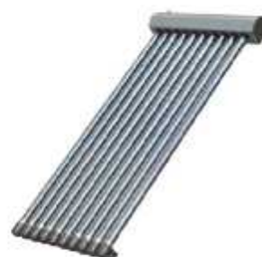
10 Tube Collector

315 Litre Esteem™ will provide sufficient hot water for up to 6 people.