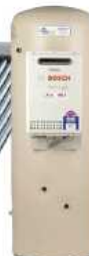
250 Litre Tank